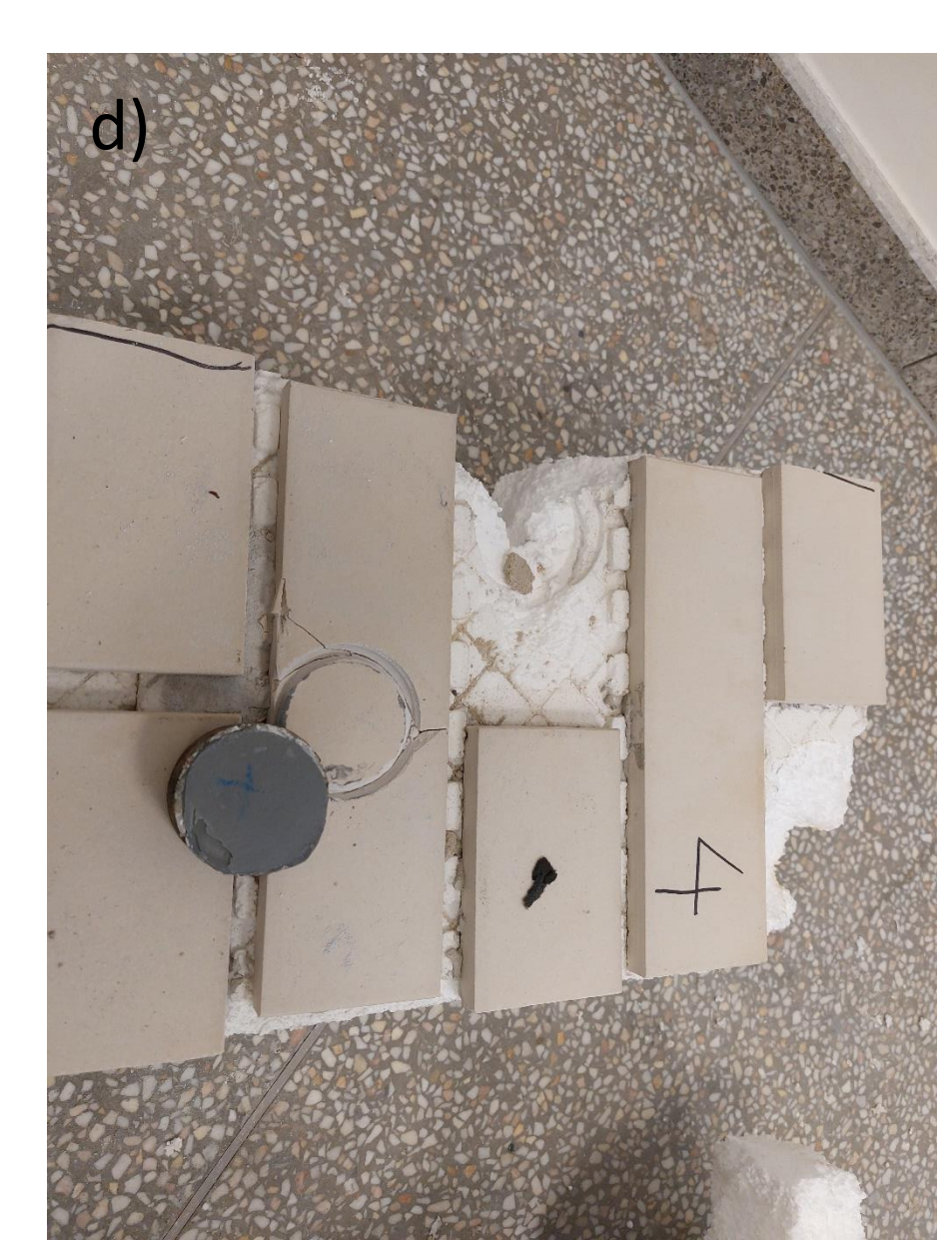
Figure 3. The view of: a) cohesive failure model in the insulation, b) adhesive failure model between the cladding and the glue, c) cohesive failure model inside the glued layer, d) adhesive failure between the steel disc and the cladding

Analysing exemplary results presented in figure 3a and 3c it can be seen that the model of failure is cohesive in "the weekest" material tested. This type of failure is the most expected and during the tests was also characterized with the highest value of pull-off strength that was approximately 0.6 MPa. In the contrary the least wanted model of failure is adhesive between the cladding and the glue, presented in figure 3b. That may be a results of not sufficient preparation or not following the all necessary guidelines of the standards. It was also proved by the lowest values obtained during pull-off tests that were lower than 0.1 MPa and are not acceptable to obtain in such structures.