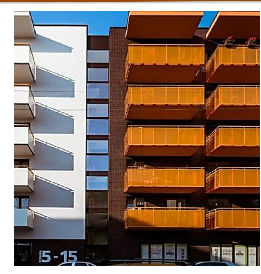
Figure 1. Examplary buildings with ceramic claddings a) in Porto and b) in Poland