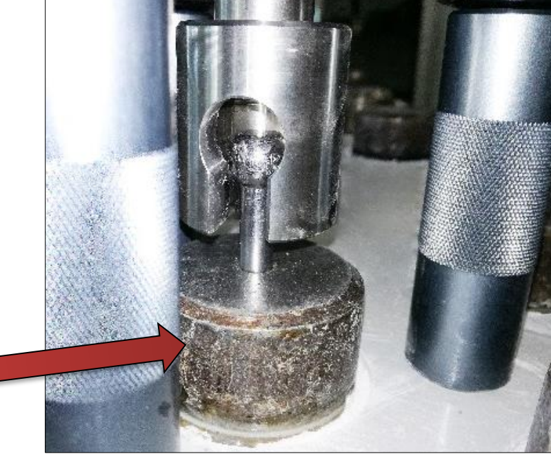
Figure 2. The view of: a) pull-off tests apparatus, b) steel disc glued to the surface